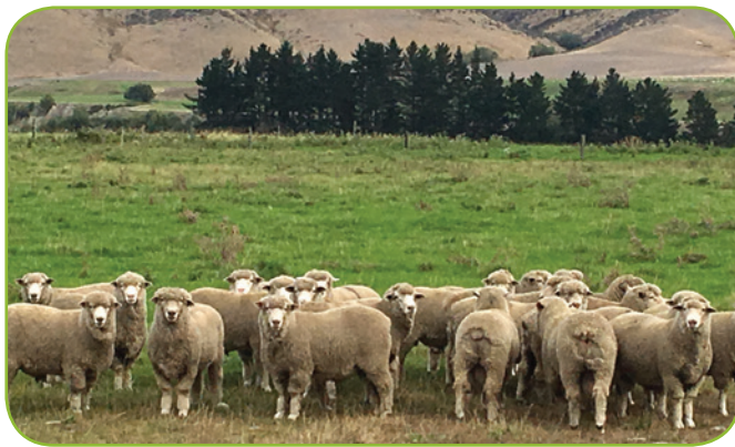
Wairere Merino SmartSheep rams at Beckenham Hills, North Canterbury

"The improvement has been significant. Lambing has lifted from 110 to 145% in 2018. Weaning weight is similar, but with more twins the total weaning weight is 32% more to sell or retain. Micron for the younger ewes has reduced from 28-28.5 to 26-26.5. Great people and better feeding has been part of the improvement. Following a brutal three year North Canterbury drought, with rainfall ranging from 240 to 450ml, kale is grown for feeding ewes 7-10 days before mating to 7-10 days after. Regrowth is then fed to twin ewes post scanning. The ewe hoggets go onto lucerne in February. These Wairere SmartSheep have given us more potential to realise, and the bottom line has improved dramatically."