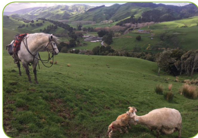
Tagging lambs at birth, Wairere, spring 2017.

Wairere has had its own breeding objectives since 2001, all variations on SIL breeding values. We have reduced emphasis on NLB (number of lambs born), preferring to favour those ewes which REAR lambs. For example SIL, in