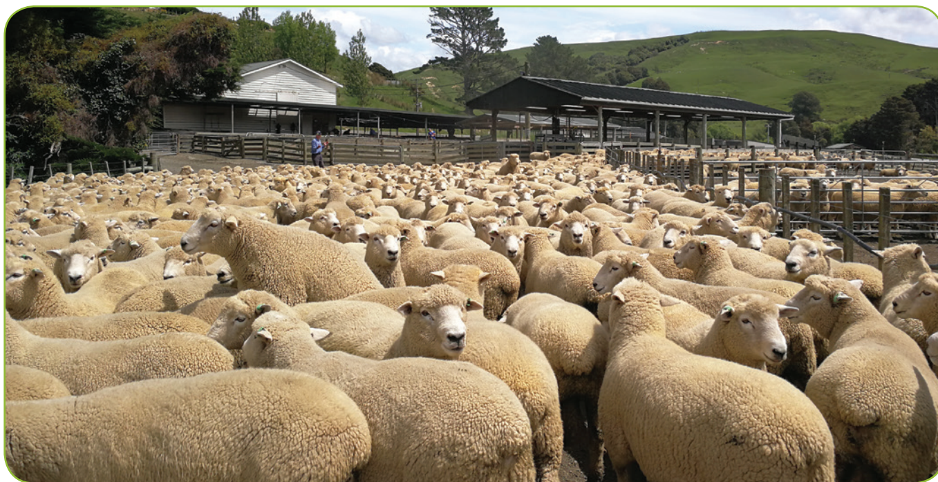
Two tooth rams at Wairere, early November 2018, thirteen months old.