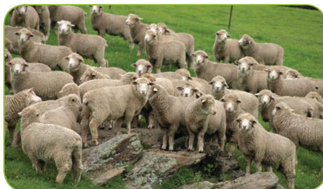
Wairere Merino ram hoggets, six months old.

Fine wool for you? Wairere started Wairere Merino in 2013. We combined the well known attributes of the Wairere Romney with the Nine Mile Merino strain which had been bred for a decade with an emphasis on more fat, more meat, and fast growth rate. Our Wairere SmartSheep are working a treat for ram clients in the right environment. However, I would warn against an expectation that these Halfbreds can be shifted anywhere in the country. Around sixteen years ago Wairere initiated a cross to Dohne Merino, a South African bred, dual purpose Merino. Despite paying $11,000 for our first sire, the third ranked Dohne in Australasia, and with a 1:1 foot score on the Lincoln DNA