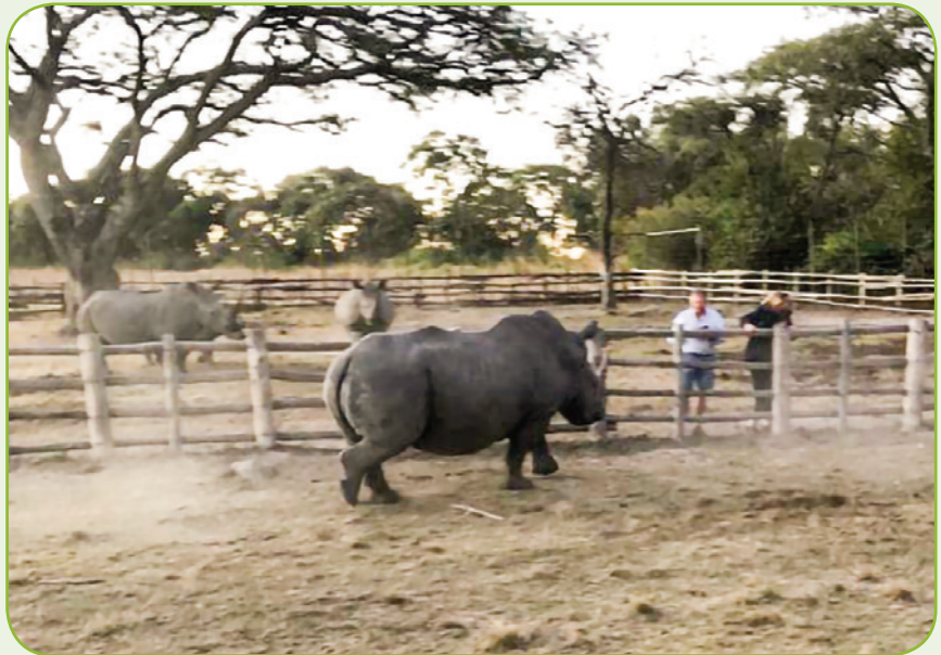
Living dangerously... I was within 50cm of being trampled by this rhino!

queuing when it becomes available. Electricity supply is random, so generators are an essential backup. The Kariba dam is at its lowest ever, yet power from there is transmitted to mines in the Congo ahead of local consumers.