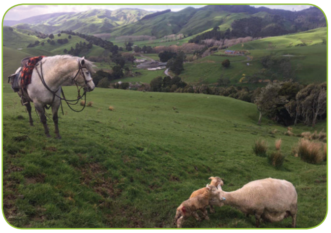
Tagging lambs at birth, Wairere, spring 2017.

Wairere has had its own breeding objectives since 2001, all variations on SIL breeding values. We have reduced emphasis on NLB(number of lambs born), preferring to favour those ewes which REAR lambs. For example SIL, in