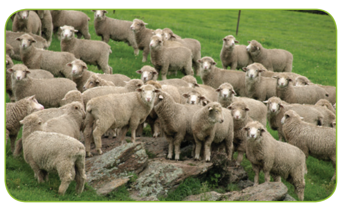
Wairere Merino ram hoggets, six months old.

Fine wool for you? Wairere started Wairere Merino in 2013. We combined the well known attributes of the Wairere Romney with the Nine Mile Merino strain which had been bred for a decade with an emphasis on more fat, more meat, and fast growth rate. Our Wairere SmartSheep are working a treat for ram clients in the right environment. However, I would warn against an expectation that these Halfbreds can be shifted anywhere in the country. Around sixteen years ago Wairere initiated a cross to Dohne Merino, a South African bred, dual purpose Merino. Despite paying $11,000 for our first sire, the third ranked Dohne in Australasia, and with a 1:1 foot score on the Lincoln DNA