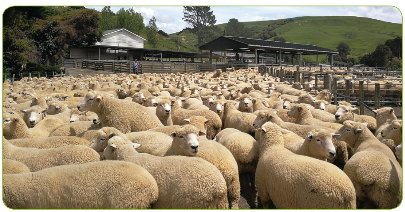
Two tooth rams at Wairere, early November 2018, thirteen months old.