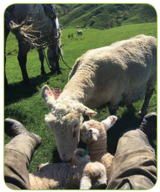
Tagging lambs, 2017, Wairere weaned 152%, but not enough BCS on this ewe!

"The improvement has been significant. Lambing has lifted from 110 to 145% in 2018. Weaning weight is similar, but with more twins the total weaning weight is 32% more to sell or retain. Micron for the younger ewes has reduced from 28-28.5 to 26-26.5. Great people and better feeding has been part of the improvement. Following a brutal three year North Canterbury drought, with rainfall ranging from 240 to 450ml, kale is grown for feeding ewes 7-10 days before mating to 7-10 days after. Regrowth is then fed to twin ewes post scanning. The ewe hoggets go onto lucerne in February. These Wairere SmartSheep have given us more potential to realise, and the bottom line has improved dramatically."