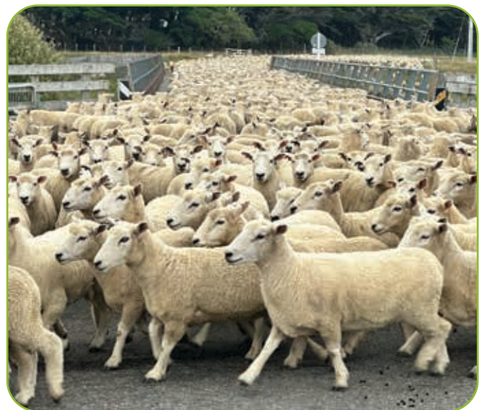
Mixed age ewes at White Rock Station. They have enjoyed a summer with green grass!