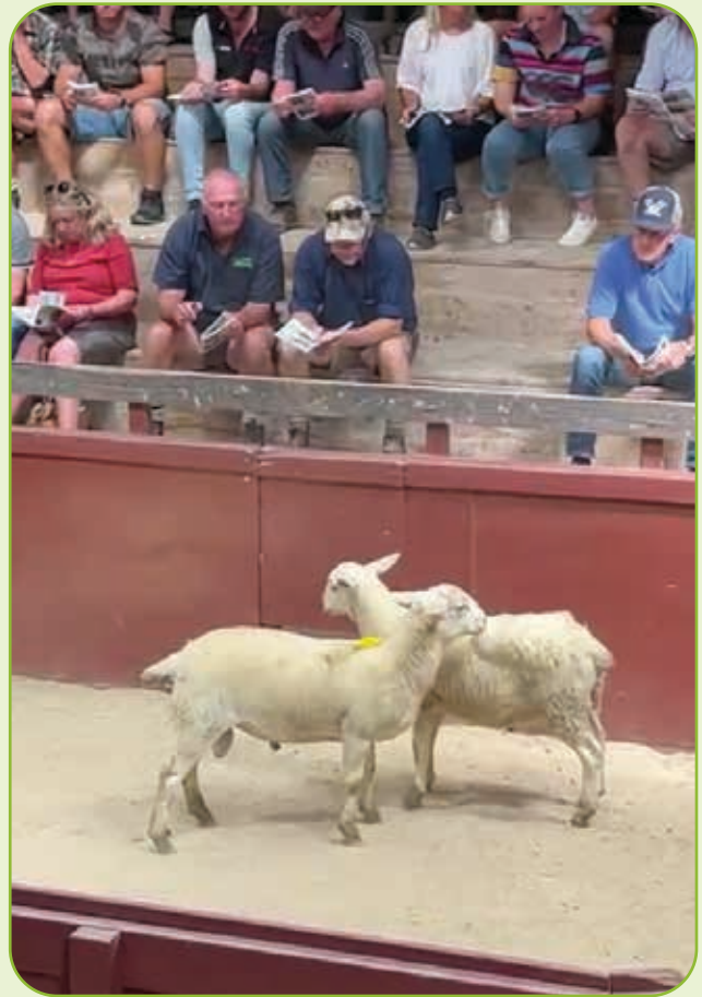
The ram lamb Nudie auction, March 1, average price was $4,600 for purebreds.

We have been discussing the best buy for commercial farmers. Would quarter Nudie progeny, from using a half Nudie ram, reduce dagging, and enable once per year shearing? That would lower costs and workload, but retain enough wool to quickly swing back to producing quality and quantity of wool when wool price rebounds. Mind you, the breakeven farm gate price has shot up to $5/kg, if all costs are properly accounted for, including accommodation, and transport.