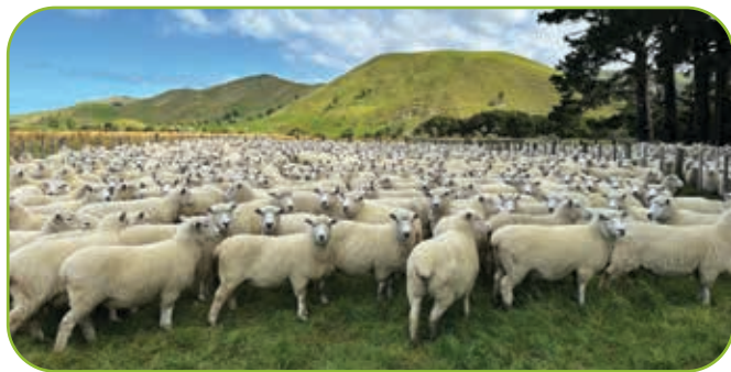
Two tooth ewes at White Rock Station, April 2023.

This is an admirable effort without any assistance and