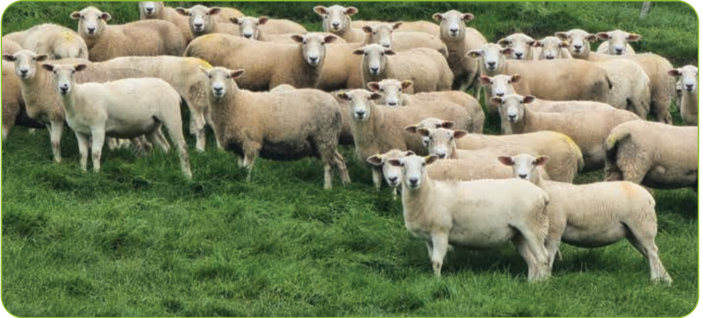
Purebred and first cross Nudie ewe hoggets being mated to purebred Nudie ram lambs, early May.

What a change in just twelve months. From one of the best years in recent times, a drop in farm gate prices plus rampant inflation in all costs is putting huge pressure on sheep farmers. The tripling and crippling of interest rates will be the biggest burden for many. For those with storm damaged properties, it will seem as though there is no end in sight. But, "lifetime memory is ten years"...keep looking forward.