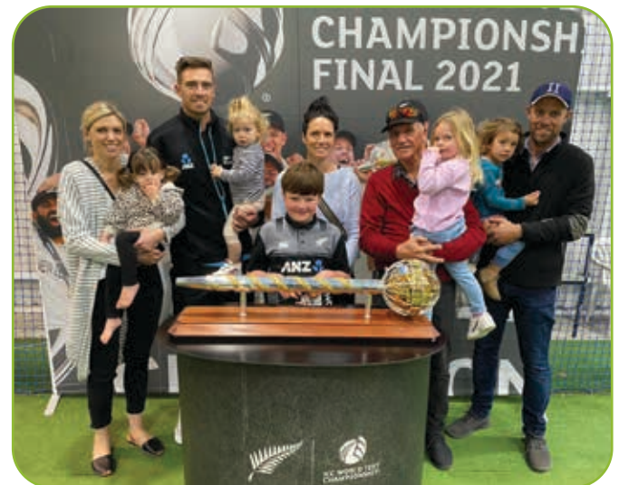
The Southee family, farming in Northland, with the World Cricket Test Championship mace.

says, "If there's a will, there's a way, to own your own farm... but "starter" farms are now being planted in trees, and there is less farm land available. So it is more difficult today."