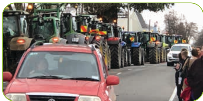
Groundswell Masterton, July 2021. Amazing support! This is a turning point in New Zealand politics.