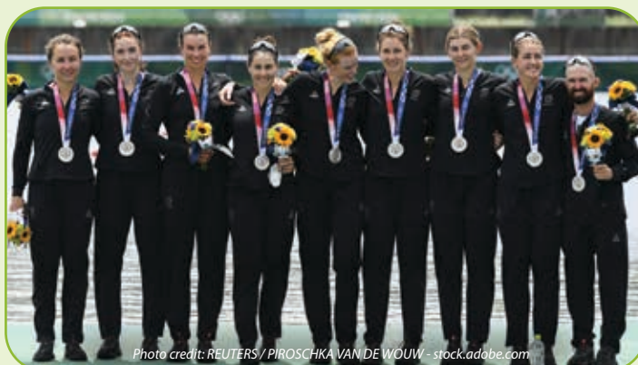
Kerri and Jackie Gowler with the Women's Eight, silver medals to go with Kerri's gold in the Pairs. How many families in the world can boast two international Olympic medalists?