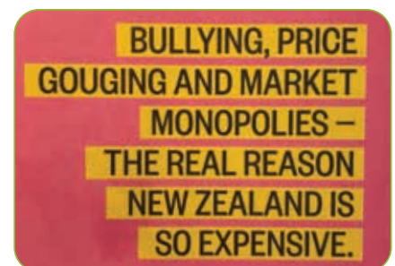
Cover page article in North & South magazine, July 2021.