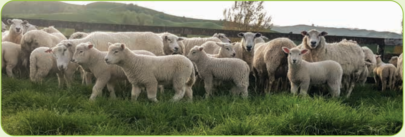
Multiplier ewes at docking 2020.

Despite very dry conditions at tugging, Pakaraka manager Chris Liddle achieved an exceptional scan of 208%. How did he do it? He gave the ewes two hours per day on a kale crop for two weeks, then two weeks full time on the crop, a week either side of the start of mating. The kale crop came in handy in the winter too, coping with 1,200 out of 1,800 ewes on the 400 hectares of summer dry hill east of Masterton. Chris also cut some poplar and willow branches for ewes in late summer.