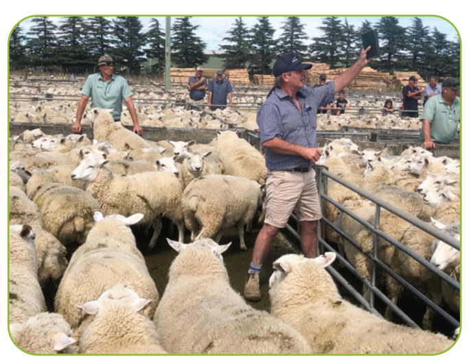
Going, going, gone ...to pine trees. Capital stock Wairere Tufguy two tooths from Birch Hill Station sold at Masterton, January 2022.

Other tools in the toolbox include using sires which have proven constitution and thrift, a slightly higher cattle ratio, weaning hoggets and their lambs before Christmas, reducing the number of lambs summered by culling harder at weaning.