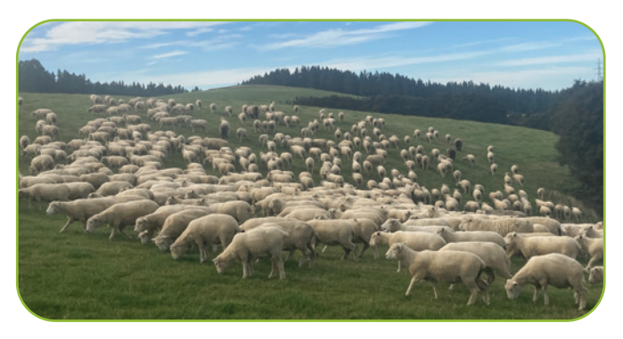
Byron's ewe hoggets with black teaser rams, May 6th. Mated those at 46kg and above. Byron has also been awarded Supreme Winner of the Otago Ballance Farm Environment Awards 2022.

Regulations have challenged us to change from swedes as a winter crop to a brassica/ryegrass mix. But the change has been positive for stock performance because of improved late pregnancy feeding. We start lambing September 7, and