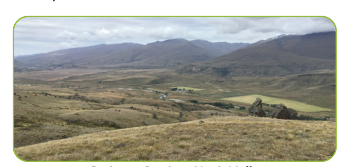
Craigroy Station, Nevis Valley