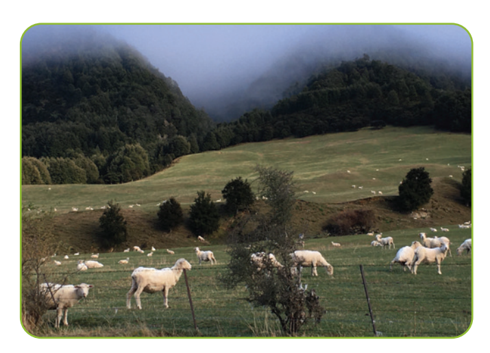
Wairere halfbred ewes at Digby Cochrane's Hunter Valley Station, Lake Hawea, September 2020.Lambing has lifted from 85 to 130% plus. Lambs are sold at weaning in early February, at 28 to 31kgs average. Every year they go to the same two buyers in North Canterbury.